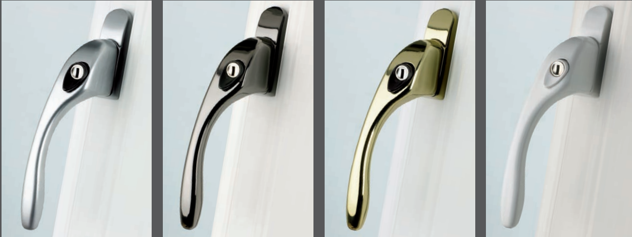
Above: ProStyle espag handles in satin chrome, smokey chrome, polished gold & white finishes.