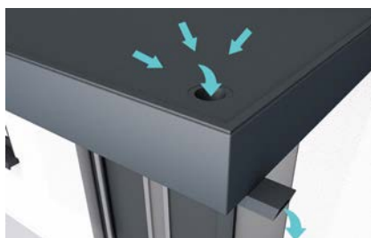
1. Roof duct with water spout

The rain water drainage varies depending on the model: